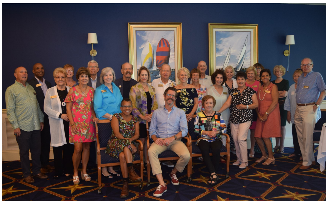
Group Photo (Please go to our facebook page and tag yourself the photo)