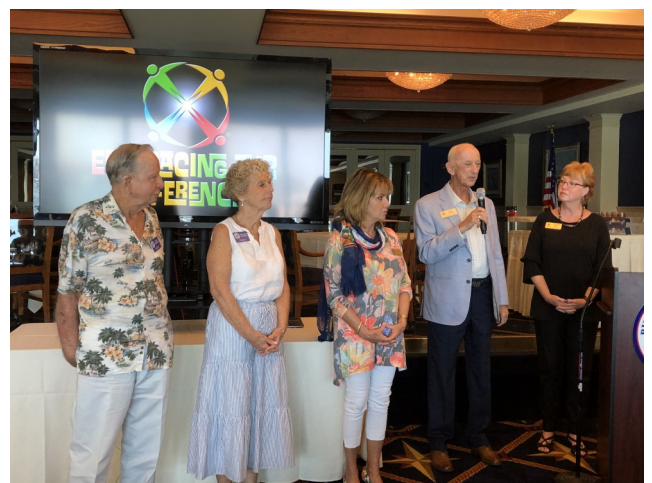
New member introductions